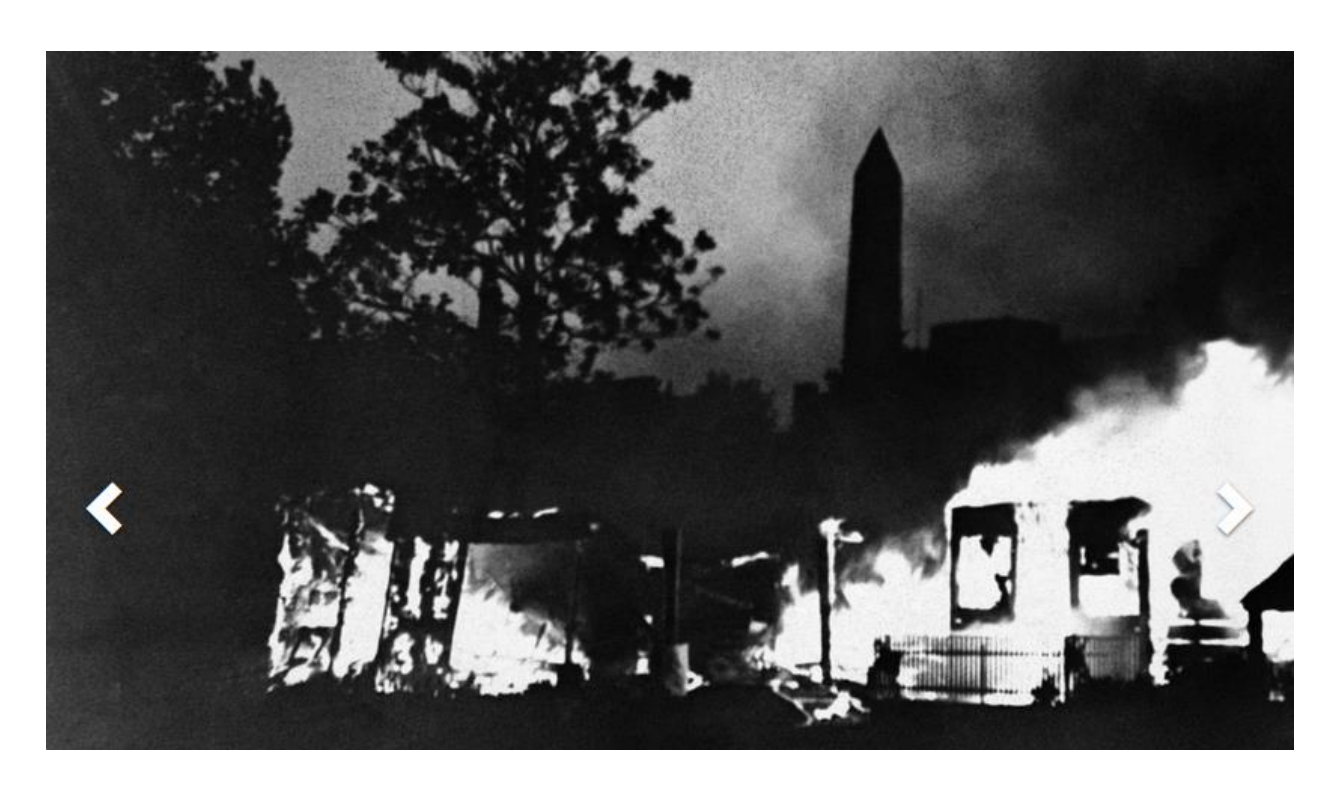
Some were killed!